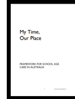
My Time, Our Place; Framework for School Age Care in Australia

Critical reflection: Reflective practices that focus on implications for equity and social justice ( Early Years Learning Framework – refer to Sources ).