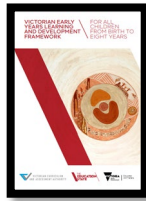
Victorian Early Years Learning and Development Framework